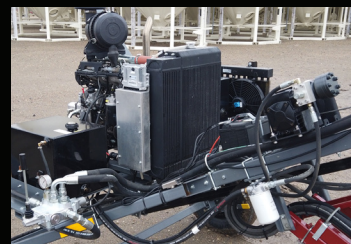
74HP Hatz Diesel