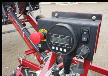
Engine Controls on Mover